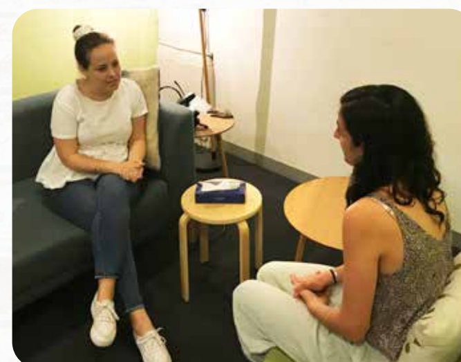
After 6 months of support, two out of three young people report improvements in mental health