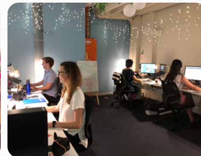
Counselling is available online, by phone or on site at one of our Canteen offices