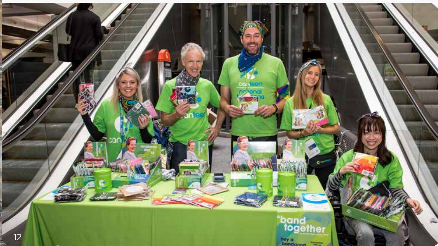
Staff and volunteers enjoy sharing the Canteen message in the community