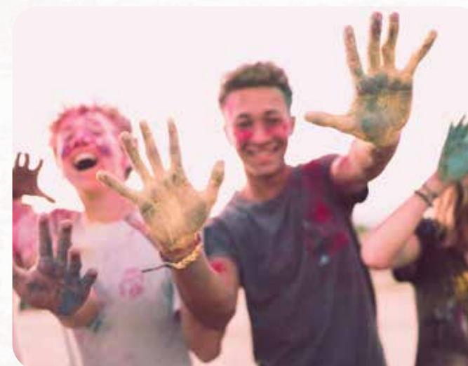
Recreation camps are a great way for young people to connect with others and just have some fun

Leaving a gift in your Will means young people in the future will be able to count on Canteen when they need us most.