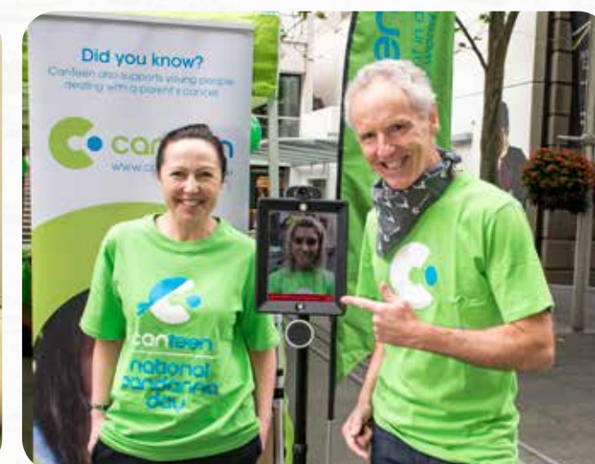
Robot technology helps young people to engage with teachers and classmates even when they can't get to school

In the past five years alone Canteen has supported young people living with cancer through the following services: